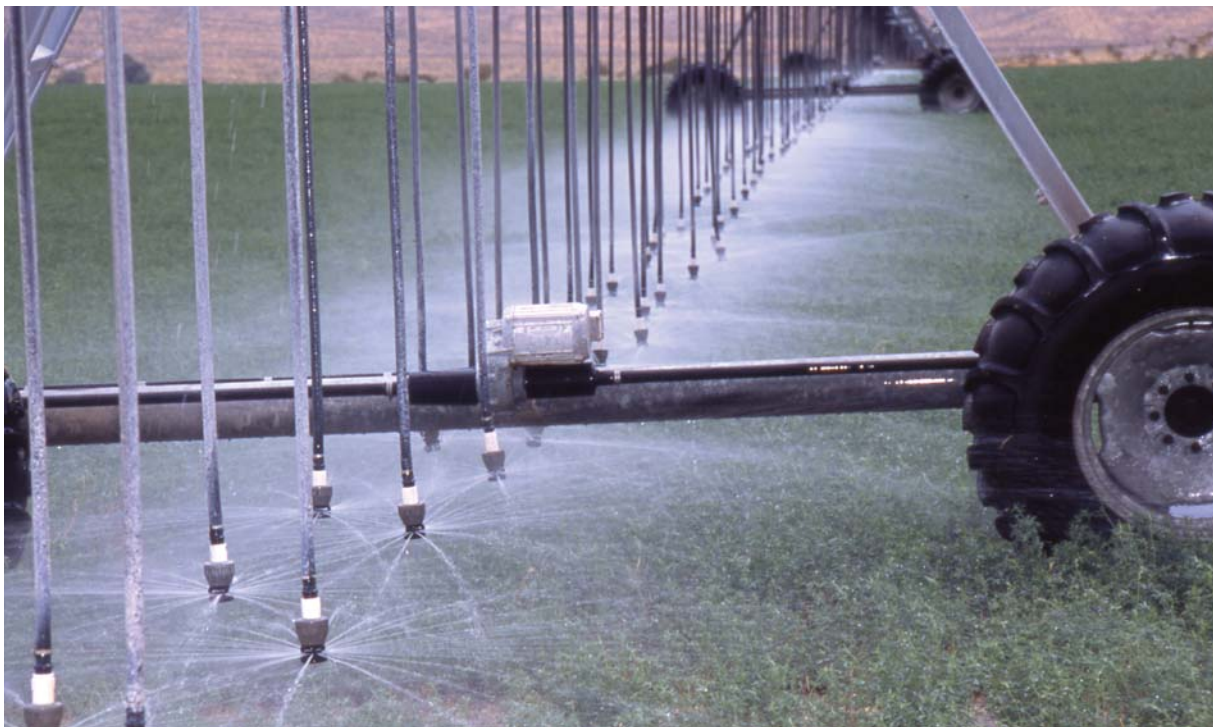
A low-energy, precision watering device irrigates an alfalfa field in Newberry Springs, Calif., part of a SARE grant project teaching farmers how to use soil moisture sensors to conserve water.

Published by the Sustainable Agriculture Network (SAN), the national outreach arm of the Sustainable Agriculture Research and Education (SARE) program, with funding from the Cooperative State Research, Education and Extension Service, USDA.